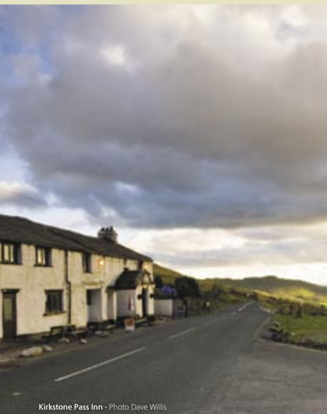
Kirkstone Pass Inn

You can also take a trip to Lakeside, taking the 11.40 boat, arriving at 12.20. You have time for lunch or a ride on the Lakeside and Haverthwaite steam railway, before catching the 14.40 boat back to Bowness. Take the 16.10 Kirkstone Rambler back to Glenridding.